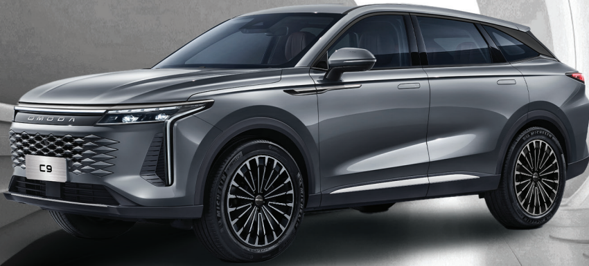
Carbon Crystal Black