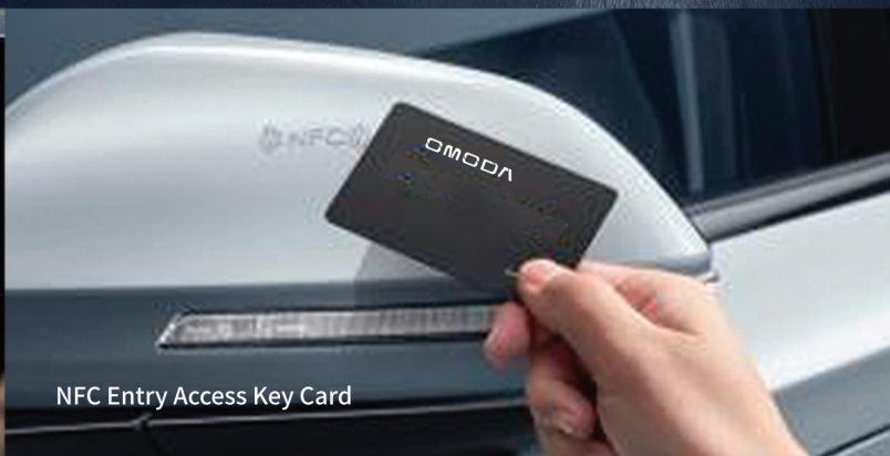
NFC Entry Access Key Card

Please pay close attention to the surrounding environment