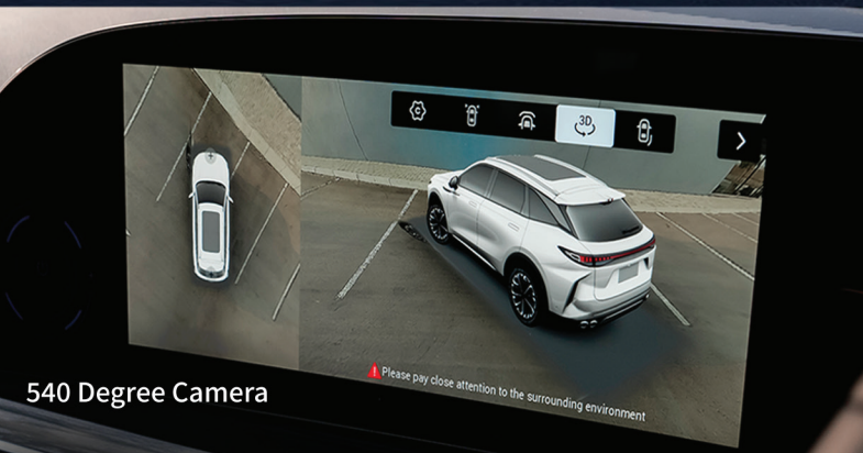
540 Degree Camera

*CDC only applicable to All-Wheel Drive variation.