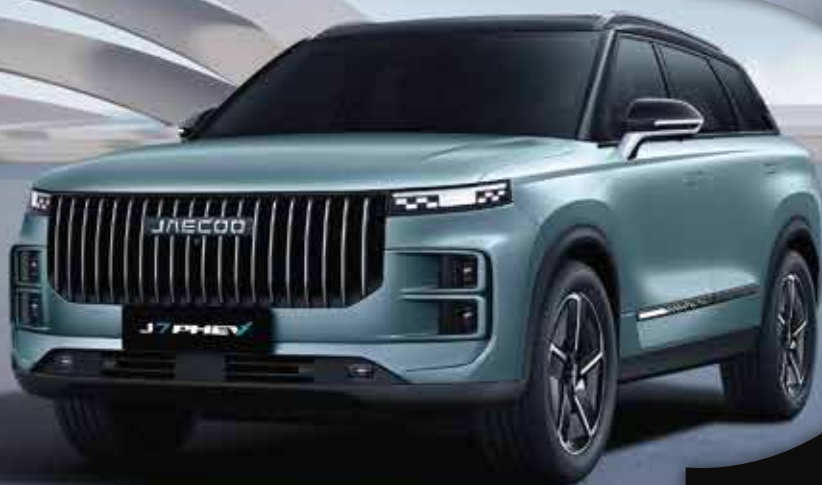
Olive Grey (coming soon)