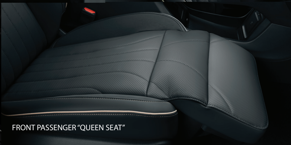
FRONT PASSENGER "QUEEN SEAT"