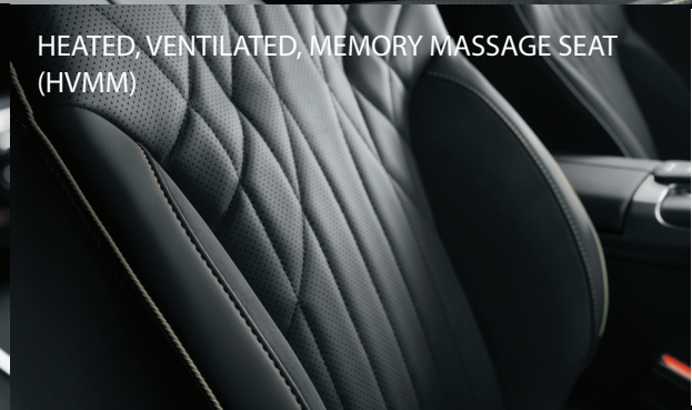
HEATED, VENTILATED, MEMORY MASSAGE SEAT (HVMM)