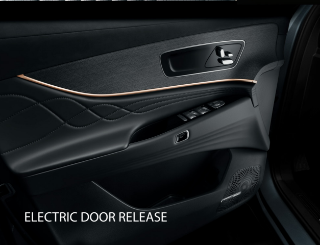
ELECTRIC DOOR RELEASE