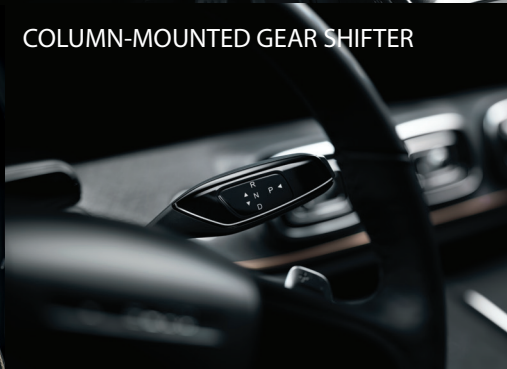
COLUMN-MOUNTED GEAR SHIFTER