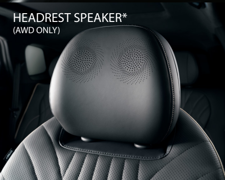
HEADREST SPEAKER* (AWD ONLY)