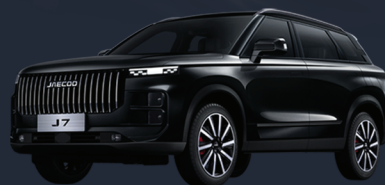
Carbon Crystal Black